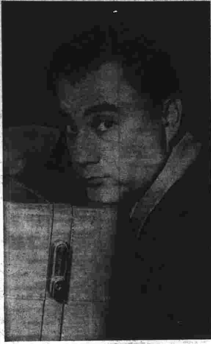
"Going up" isn't going to mean "blastoff" to Jose Jimenez from now on. The erstwhile astronaut's mascot won't be riding any higher than the elevator will take his role as bellhop in a luxury hotel for the "Bill Dana Show" set for fall and winter Sunday nights on NBC.

Jose popped into being when "we were kicking around a Santa Claus idea and I said that in Spanish 'j' sounds like 'h' and we thought of a bit where Santa said 'jo, jo'. While we looked around for somebody to do it on the air,